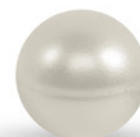
40 Round Up to 2,280mg